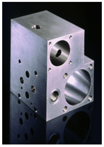
Every component of a Gleeble system is manufactured to precise tolerances.