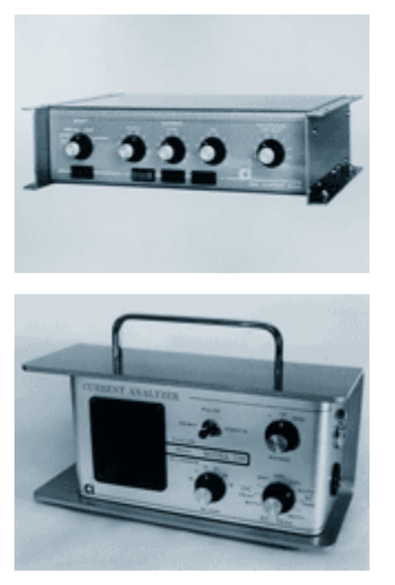
From 1960 to 1990 DSI also manufactured resistance welding