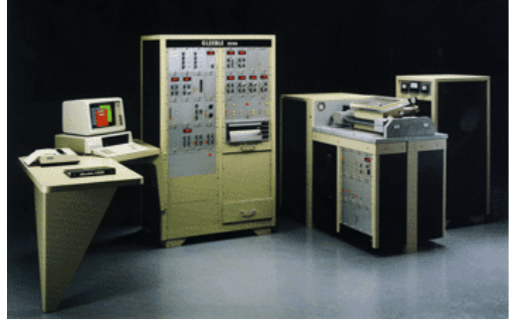
The Gleeble 1500, manufactured from 1979 to 1995, was the first system to feature PC-based controls and closed-loop servo hydraulics with high-speed direct resistance heating. This combination provided a platform for new physical simulation applications.

In 1979, DSI introduced the Gleeble 1500 which was the second generation design. It featured all-new electronics design and all-new hydraulics design, combined with a resistance heating system.