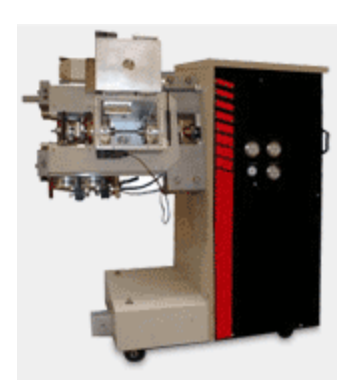
The DSI Hot Torsion system is available as a stand-alone machine or as an option for use with Gleeble 3500 and 3800 physical simulation systems.

quality control instruments. These included secondary current and voltage measuring instruments that were used by major automotive and appliance manufacturers worldwide.