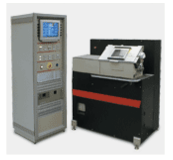
The ISO-Q Quenching and Deformation Dilatometer was introduced in 2000.