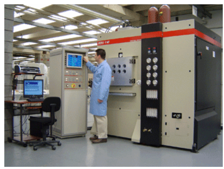
The HDS-V40, introduced in 2004, is capable of simulating direct rolling, from the continuous caster to the end of the hot rolling process, all in one continuous sequence.

For the first time ever, steel and specialty metal makers had a system with the versatility to simulate continuous casting followed by direct rolling on an affordable, reproducible laboratory scale. In addition to direct rolling, the system could be used for simulating a variety of other processes including semi-solid rolling, liquid metal core reduction, hot rolling and forging. Configurations for both plane strain compression and cylindrical compression are available.