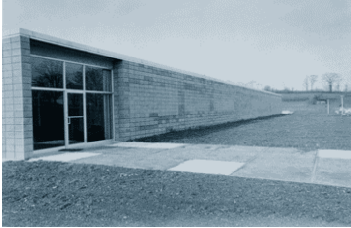
In 1966 DSI moved into a new factory and corporate offices located in Poestenkill, New York. This photo was taken just after completion of the new building.

During that time the company moved into a facility in Troy, New York. In 1966, construction would be started on the current DSI headquarters in Poestenkill, NY. In the 1970s, DSI exports expanded further with sales of Gleeble systems to steel manufacturers in Japan.